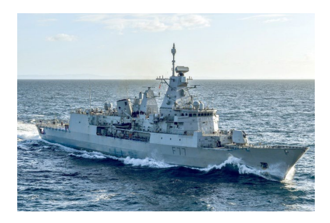
Figure 1: Te Kaha on the Pacific Ocean (2022).