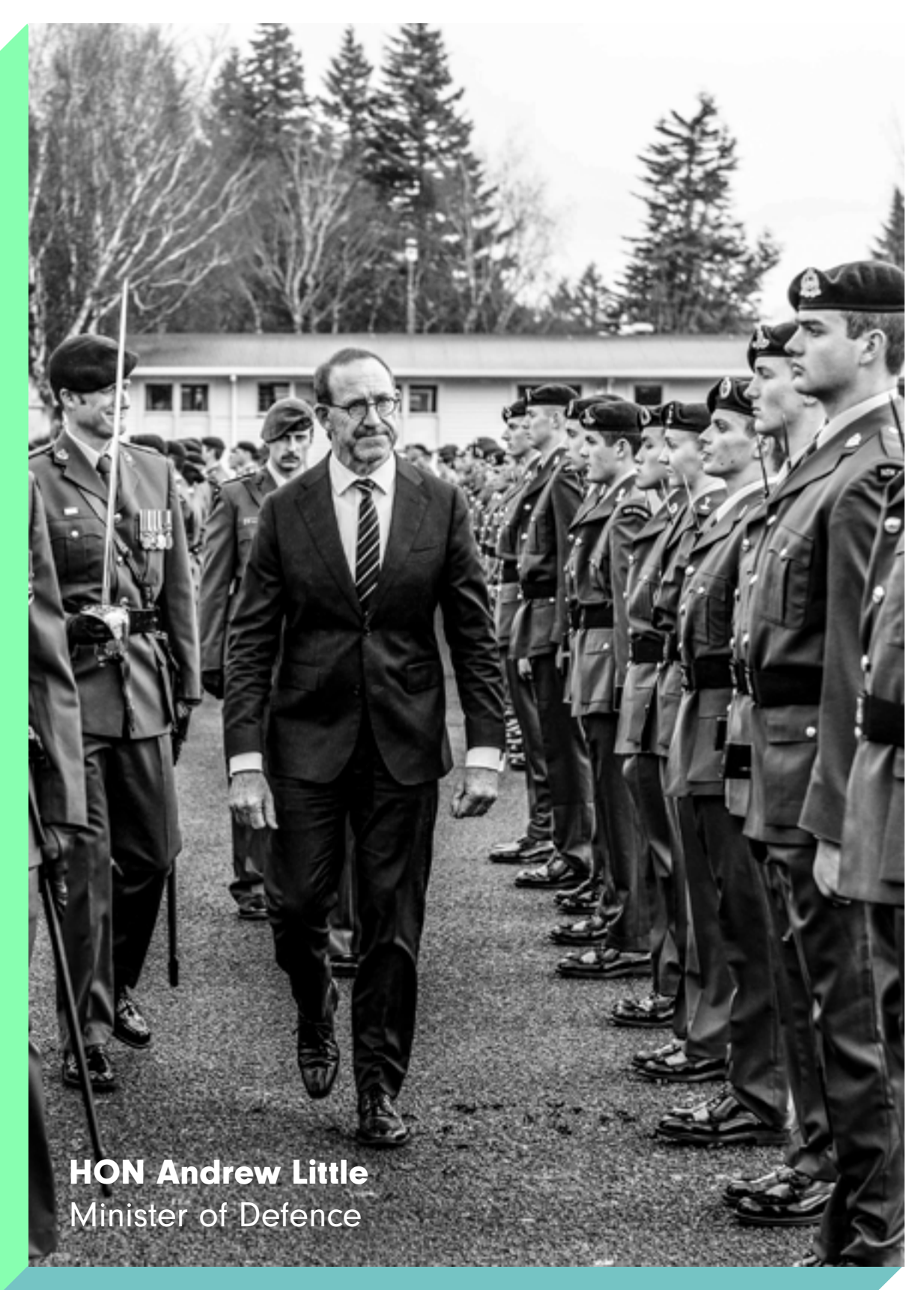
IMAGE: Defence Minister Andrew Little at the Recruit Regular Force 410 Graduation Parade in Waiouru.